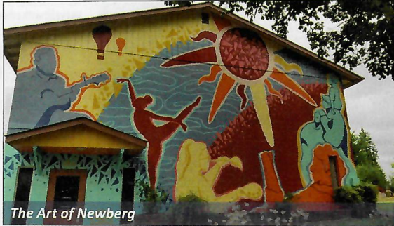
The Art of Newberg