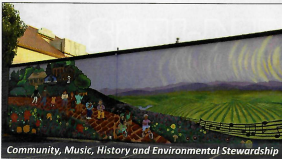
Community, Music, History and Environmental Stewardship