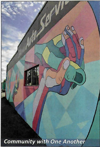
Community with One Another